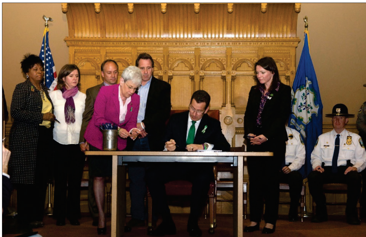
Joined by families of those who were killed in the tragedy at Sandy Hook Elementary School, in addition to members of law enforcement and state lawmakers, Governor Malloy signs into law a comprehensive bill on gun violence prevention, mental health initiatives, and school safety policies written in the aftermath of the Newtown tragedy. (April 4, 2013)

On April 3, 2013, the House passed Public Act 13-3, An Act Concerning Gun Violence and Children's Safety , 74 with a bipartisan vote of 105-44. The Senate approved the bill in a similarly bipartisan fashion, 26-10. The Governor signed the bill on April 4, 2013.