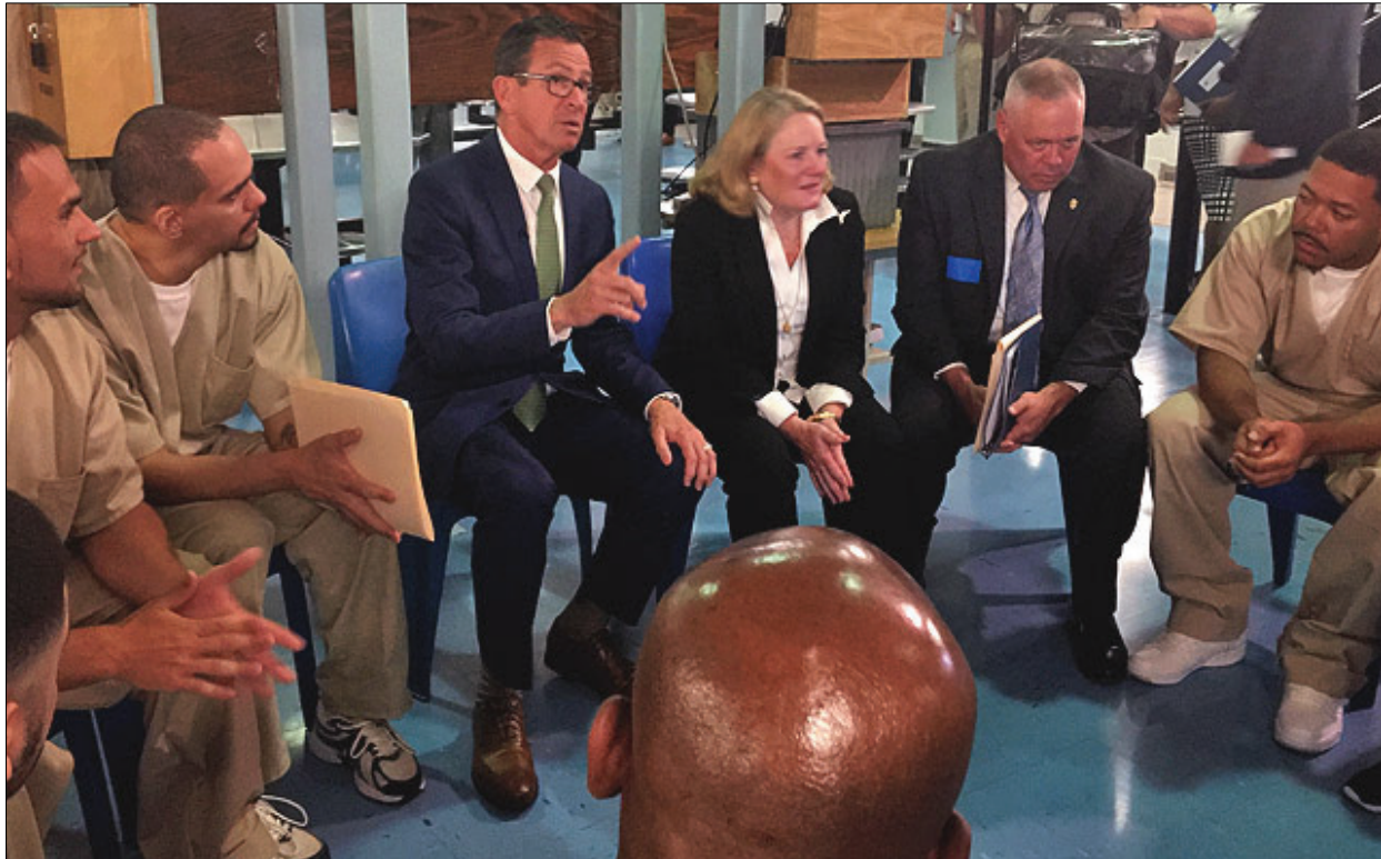
Governor Malloy and First Lady Cathy Malloy speak with a group of inmates during the "Reimagining Justice 2018: Outside In" conference at the Cheshire Correctional Institution on May 30, 2018. Attended by 150 guests from the state's criminal justice community, it was the first time in the nation that a conference of this kind was held inside the walls of a maximum security prison, giving attendees an opportunity to see such a facility from the inside.