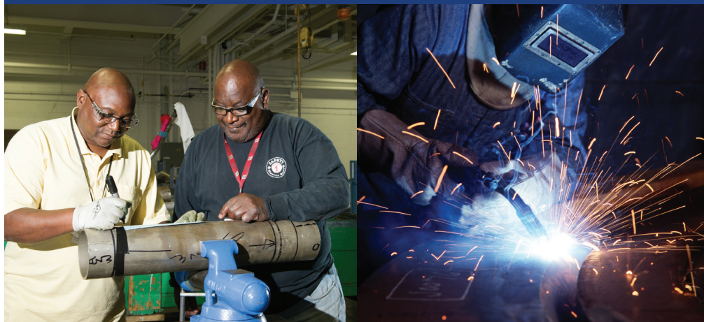
*These statements pending the US Navy's execution of their 30 year shipbuilding plan.