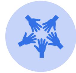
State Data Plan