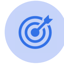
Impact & Evaluation