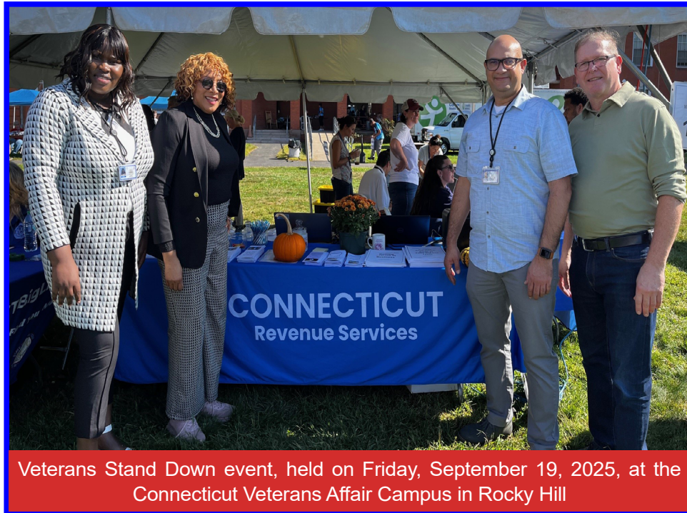
Veterans Stand Down event, held on Friday, September 19, 2025, at the Connecticut Veterans Affairs Campus in Rocky Hill