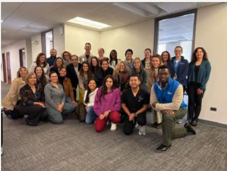
The medical team at Holly Hill with School-Based Health Center staff.

The Holly Hill team prioritized strong communication and patient education, providing families with up-to-date CDC Vaccine Information Statements (VIS) and clear guidance on how to continue care at the new location. Their proactive outreach ensured that all children remained current on preventive care and immunizations.