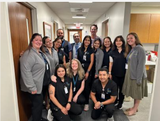
The medical team at Holly Hill in their new facility.

Additionally, the clinic successfully implemented a new temperature monitoring system with real-time alerts for vaccine storage units. Staff took personal initiative to respond to after-hours and weekend alerts, arriving on-site when needed to verify storage conditions and prevent potential vaccine loss.