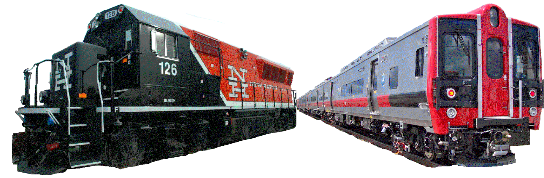
BL20GH DIESEL-ELECTRIC LOCOMOTIVE M-8 AC/DC ELECTRIC-PROPELLED COACH