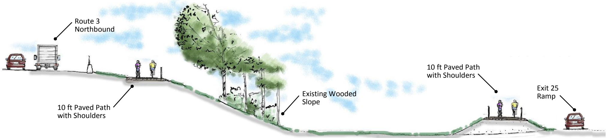
Alternative 1 | Intermediate Section (looking in northbound direction)