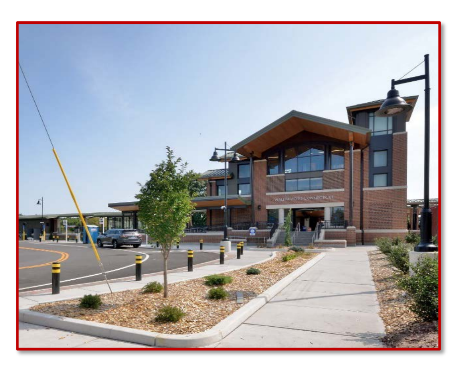
Wallingford Station (September 2017)