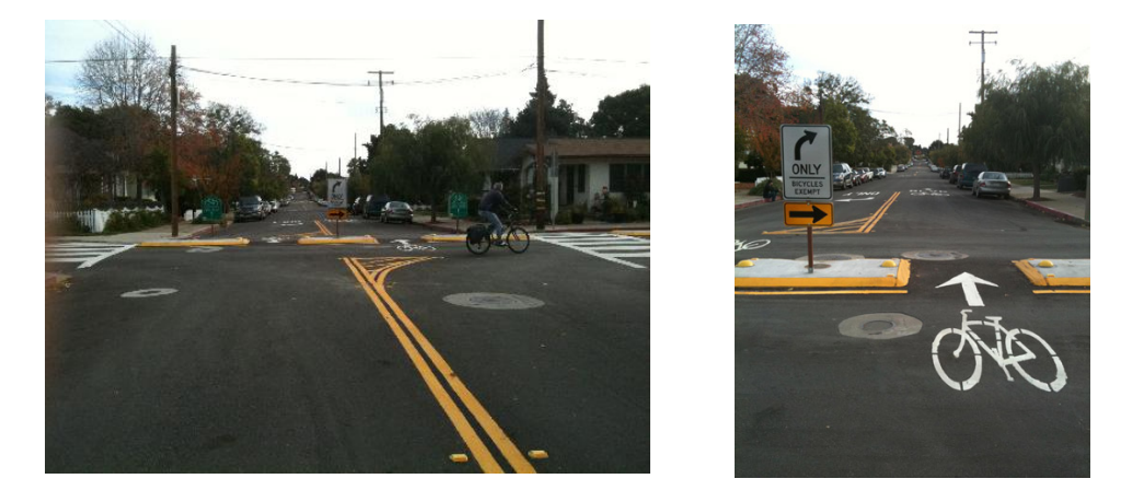
Pros :: Reduces cut-through traffic; Channels traffic flow, thus eliminating vehicular conflicts at some intersections; can be designed to accommodate emergency

A diverter is an island built at a residential street intersection that prevents certain through and/or turning movements. Partially or fully closing access to a neighborhood street will certainly increase traffic on surrounding streets. These should be used as measures of last resort and only considered if other less restrictive physical measures have failed.