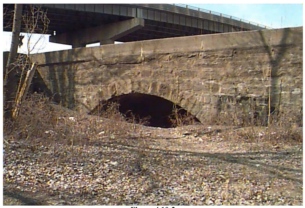
Figure 4.10-2 Amtrak Stone Arch Associated with Previous Alignment of Park River (Sisson Avenue Interchange Ramp Overhead)

The most notable Amtrak resource in the West Side Access study area is a stone archway within the I-84 Sisson Avenue Interchange. The arch originally carried the tracks over the Park River before relocation of the Park River to an underground conduit. This structure, shown in Figure 4.10-2, would be altered by the New Britain – Hartford Busway project. For that project, SHPO has requested that ConnDOT will provide photographic and narrative documentation this structure, which would be removed and replaced with fill on the busway side, with the Amtrak portion remaining intact.