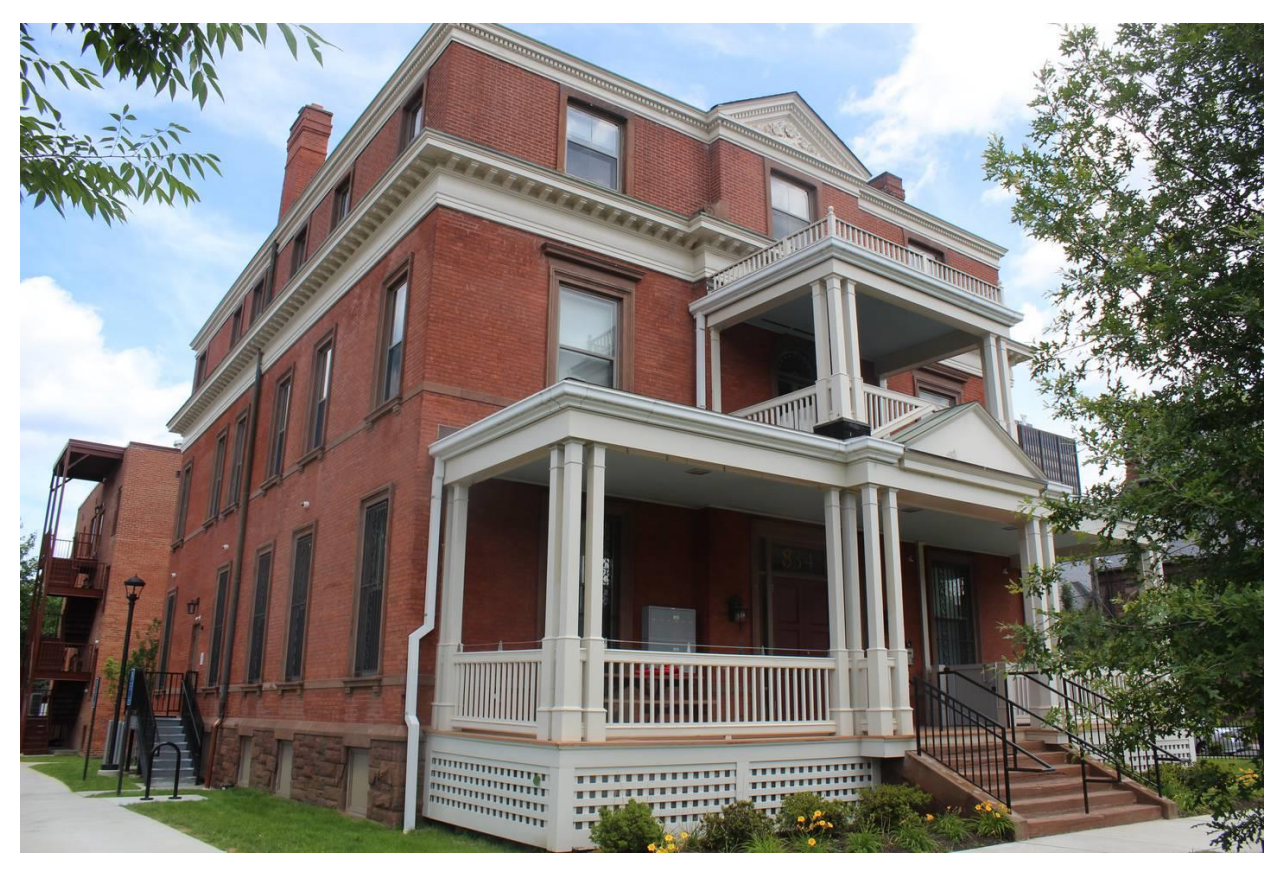
The building at 834 Asylum Avenue, a part of Clover Gardens affordable housing complex. (Ted Glanzer)

"These buildings were derelict and deteriorated," Bronin said. "They were a blight and they are beautiful right now. ... You can feel the difference in a powerful way as you drive down the avenue. It looks and feels different in an uplifting and powerful way."