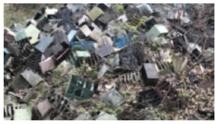
Clean up at Wood Industries, San Antonio, Texas

• San Antonio, Texas (2018). Remediation and removal. Following the Resource Conservation and Recovery Act program assessment of Wood Industries, a former plastic recycler in San Antonio with limited resources, the EPA removed the threat posed by the lead left on the site, approximately 4000 tons of cracked automotive batteries contaminated with 15% lead. While the site is now located in a sparsely developed commercial and industrial area, a new housing development has just started within sight of the facility. EPA will treat the battery casing, chips and ash with a proprietary reagent to allow for