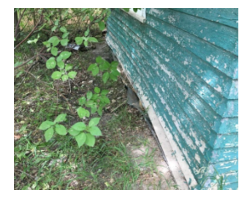
Brownfields Cleanup, Spirit Lake Reservation. Photo of an abandoned building contaminated with asbestos, lead-based paint, and lead in the soil.