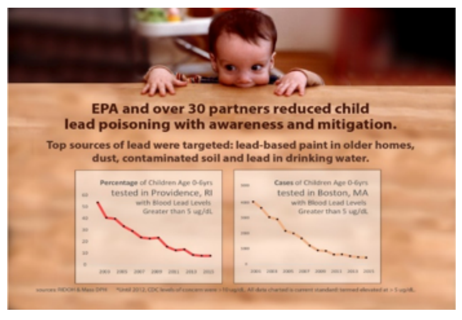
EPA worked closely with partners to achieve reductions in lead poisoning in Providence, Rhode Island and Boson, Massachusetts.

built on the existing education, training, and community-building efforts in Providence, Rhode Island, and expands the work to East Providence and Pawtucket, communities with higher than average rates of lead poisoning in the state. These projects convened stakeholder groups in each community to plan, implement, and evaluated the activities necessary to bring the cities into alignment with the laws and regulations that govern lead. City officials with lead enforcement responsibilities were provided education to improve their understanding of the state's Lead Hazard Mitigation Act and EPA's Renovation, Repair, & Paining Rule (RRP), and outreach and education was provided to contractors