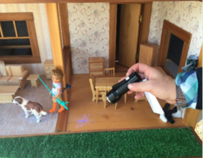
Region 10 Panhandle Health District Fair