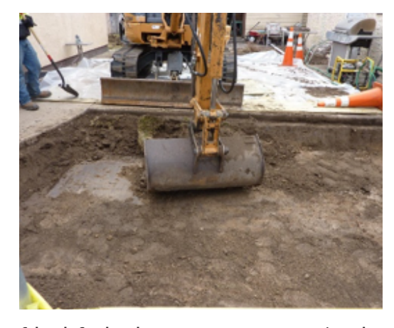
Colorado Smelter cleanup crews excavate contaminated soil from a residential property in Pueblo, Colorado

In summer of 2018, EPA announced $15 million a year for the next 5 years will be used to accelerate the cleanup of the Colorado Smelter Superfund site. The additional funding will speed up the sampling and cleanup activities in the residential area of the site and should result in the completion of the cleanup about six years sooner than previously estimated. EPA's work will help to significantly lower blood lead levels particularly in children, who are most vulnerable to the harmful effects of lead poisoning. In addition to accelerating the cleanup at the Smelter site, EPA has provided over $500,000 since