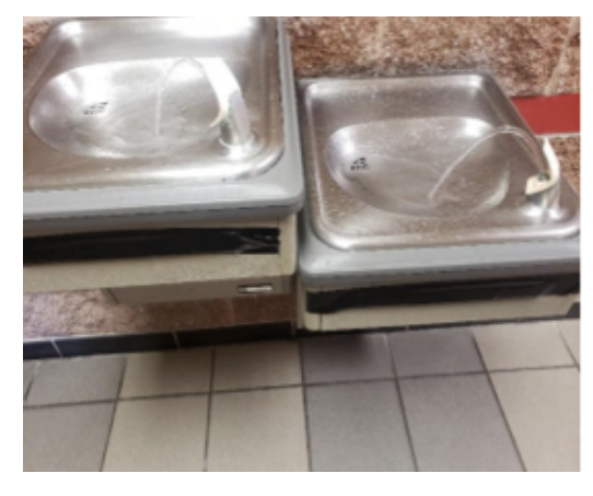
Tribal school sampling for lead conducted and documented to reduce exposure risks in children Sac and Fox Nation (Jeremy Fincher)