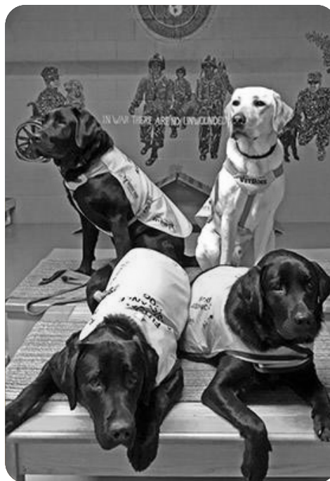
VETDOGS IN TRAINING AT OSBORN

Welcome to the first issue of Reentry Today , a joint publication of the CT Department of Correction and the CT Reentry Collaborative. Designed to bridge the gap between what's happening to support reentry both inside and outside of the state's correctional institutions, the newsletter provides featured articles, interviews, updates, visual media, informative graphics, general information and more. Reentry Today will be published in print four times a year and will also be available online at www.ctreentry.org .