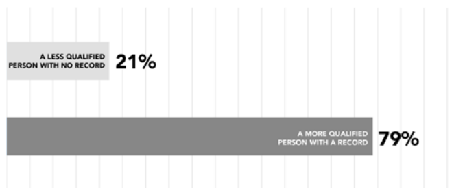
POLLING RESULTS FROM CBIA’S CONFERENCE