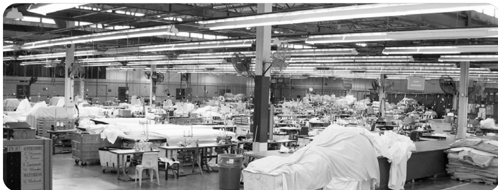
THE FLOOR OF THE TEXTILE SHOP IN "INDUSTRIES"