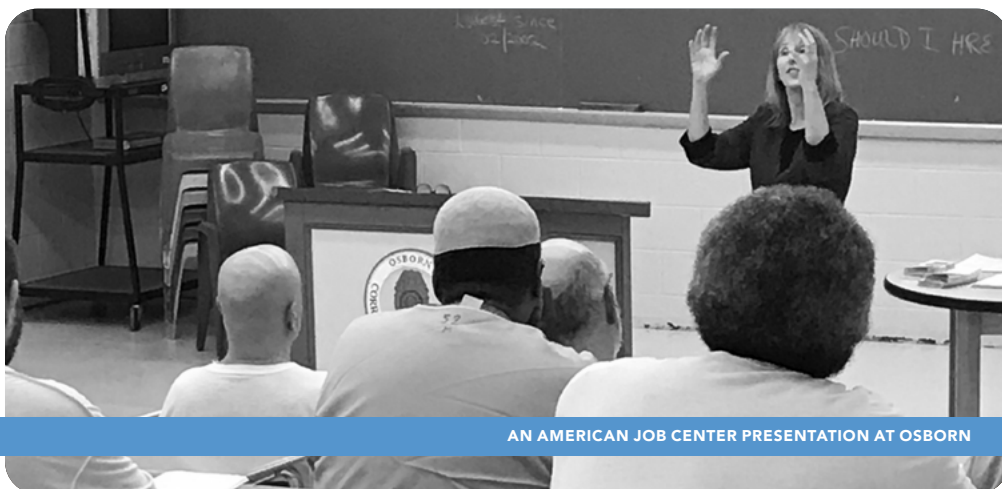
AN AMERICAN JOB CENTER PRESENTATION AT OSBORN