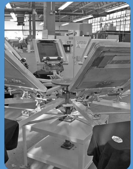
SCREEN-PRINTING MACHINE USED IN "INDUSTRIES"