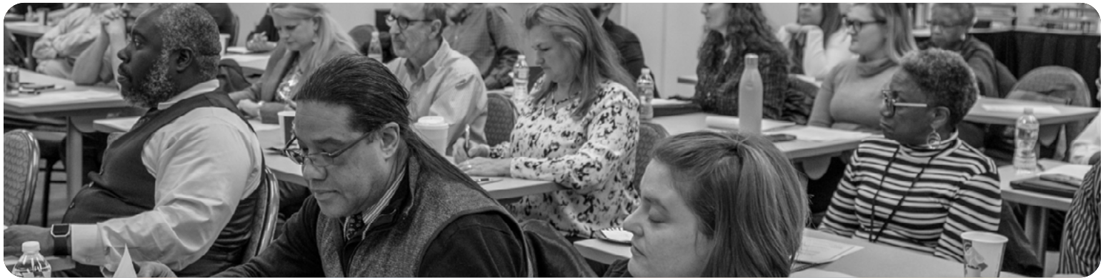
HARTFORD REENTRY ROUNDTABLE ATTENDEES