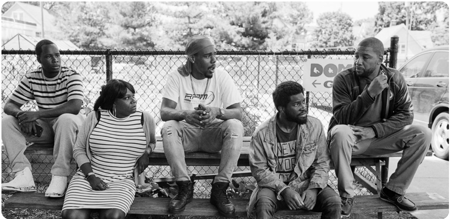
DOMUS IN STAMFORD