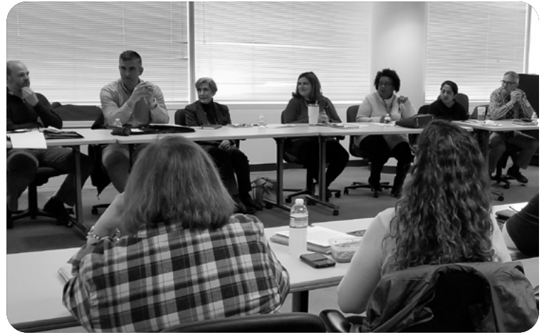
STAMFORD REENTRY ROUNDTABLE MONTHLY MEETING

Since its inception in the summer of 2018, the Stamford Reentry Roundtable has assisted in successful reentry for previously incarcerated residents in the Stamford area. Through partnerships and collaboration with state and local community organizations, the Roundtable identifies reentry needs and addresses gaps in services for individuals returning to the community. The Roundtable achieves this work through subcommittees that focus on four specific areas: employment, housing, advocacy, and the provision of additional community resources. The Stamford Reentry Roundtable hopes to continue to build capacity so they can serve as a direct hub for returning citizens.