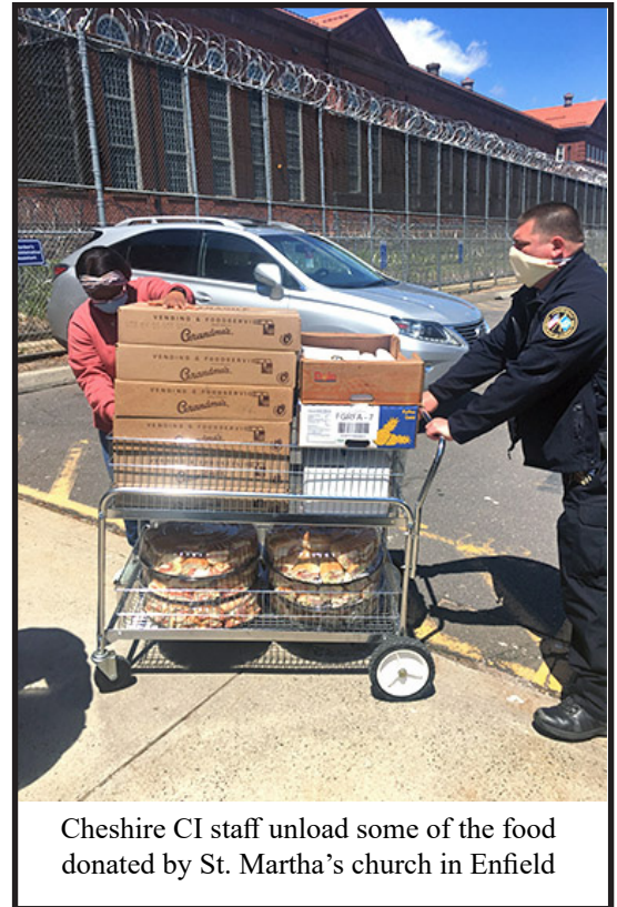
Cheshire CI staff unload some of the food donated by St. Martha's church in Enfield