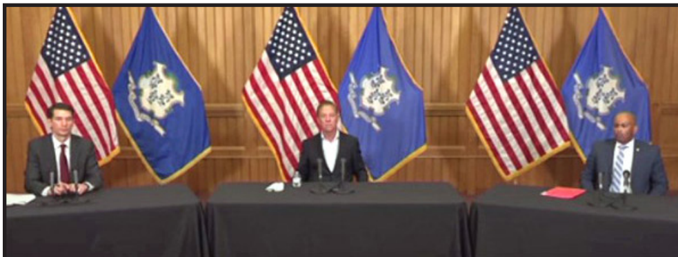
Governor Ned Lamont (C) with Criminal Justice Undersecretary Marc Pelka (L), announcing the nomination of Angel Quiros (R) to be the next DOC Commissioner.

Governor Ned Lamont officially selected Angel Quiros as his nominee to be the next Commissioner of the Connecticut Department of Correction. The Governor's announcement was made at a press conference held inside the State Capitol on September 2, 2020.