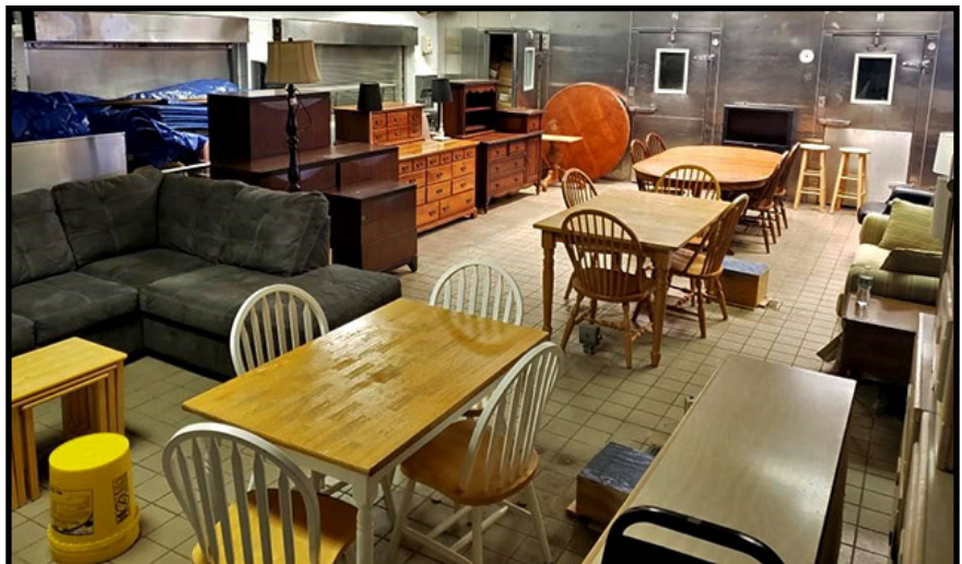
A portion of the donated furniture on display at Webster CI.