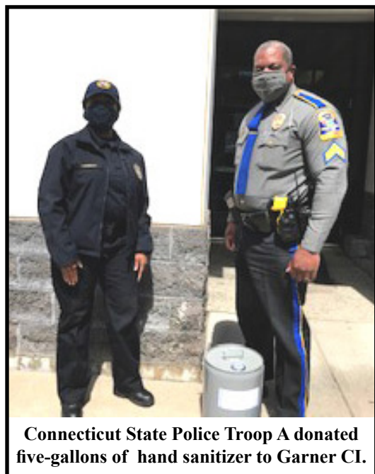
Connecticut State Police Troop A donated five-gallons of hand sanitizer to Garner CI.

to deliver 100 pizzas to MYI's and Cheshire CI's staff; also, with the help of Cheshire CI's Catholic Chaplain, Saint Martha Catholic Church in Enfield donated sandwiches, salads, cookies and ice cream for all three shifts; Chesprocott Health District donated masks and hand sanitizer to Cheshire CI; CrossFit Blue Diamond in East Longmeadow, MA donated energy drinks; Dickinson Brands of East Hampton donated hand sanitizer to the Carl Robinson Correctional Institution Doughlicious in New Haven donated boxes of edible cookie dough for the staff at the CERT house; Elite Nutrition Smoothie and Juice Bar of East Longmeadow, MA donated beverages to the staff at Northern CI; Home Depot of Lisbon and Montville, Lowes of Waterford, Walmarts of Groton, Lisbon, Norwich and Waterford all donated Lysol disinfectant spray, hand sanitizer and disinfectant wipes to the Corrigan-Radgowski Correctional Center, Additionally NY Pizza in Danielson, and Long Shots Sports Cafe in Uncasville donated pizza and wings to CRCC staff.