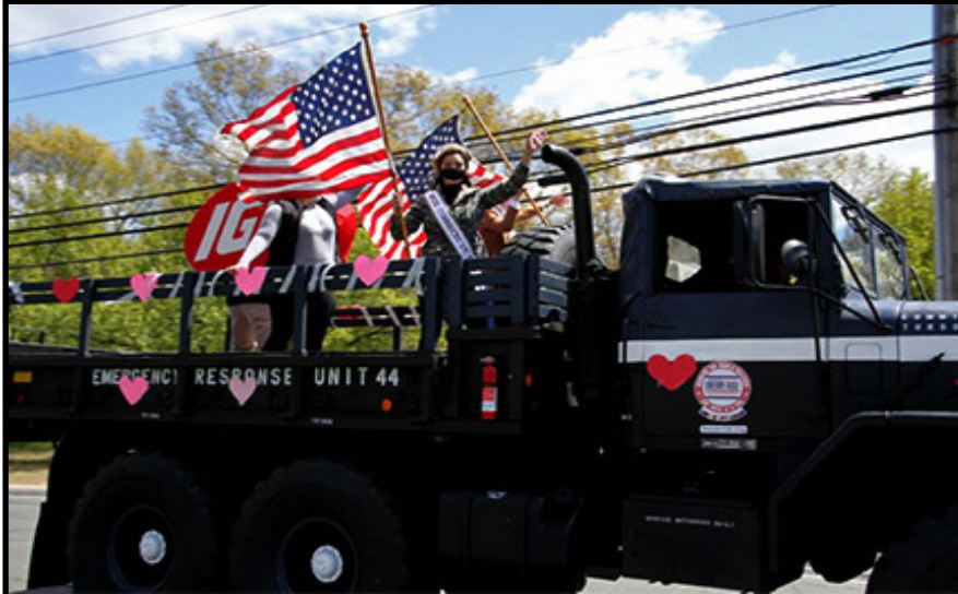
Part of the Cheshire "Thank You Tour" Rolling Parade

from Connecticut State Police Troop A; the Garner facility was the recipient of 35 gallons of hand sanitizer from Bedoukian Research in Danbury, and 30 bottles of hand sanitizer from Litchfield Distillery; The Killingly-Brooklyn Rotary donated gift certificates to local pizza restaurants and The Ice Box in Brooklyn, CT provided ice cream sundaes with all the fixings to the staff at the Brooklyn Correctional Institution; Life Bowls Smoothie and Juice Bar donated nutritious smoothies to the staff at New Haven CC; Luann's Bakery in Ellington donated baked goods on more than one occasion; working side by side with Nutrition