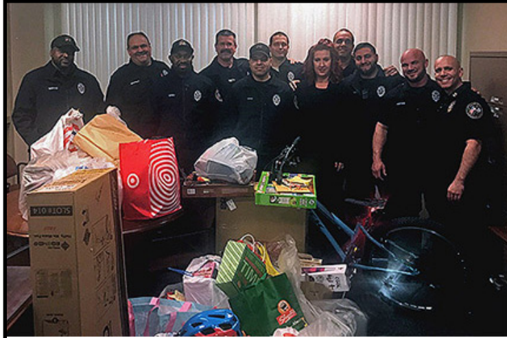
Some of Santa's Helpers with their bounty at Northern CI

Staff members of the Northern Correctional Institution generously donated a variety of gifts for 30 children under the care of the Milford DCF office this Christmas. The gifts ranged from bicycles, toys, clothing, and games, to gift cards. This was the first time Northern participated in this act of kindness for Christmas. Coincidentally, this was the first time the Milford DCF office worked with the Department of Correction in receiving toys for children under their care.