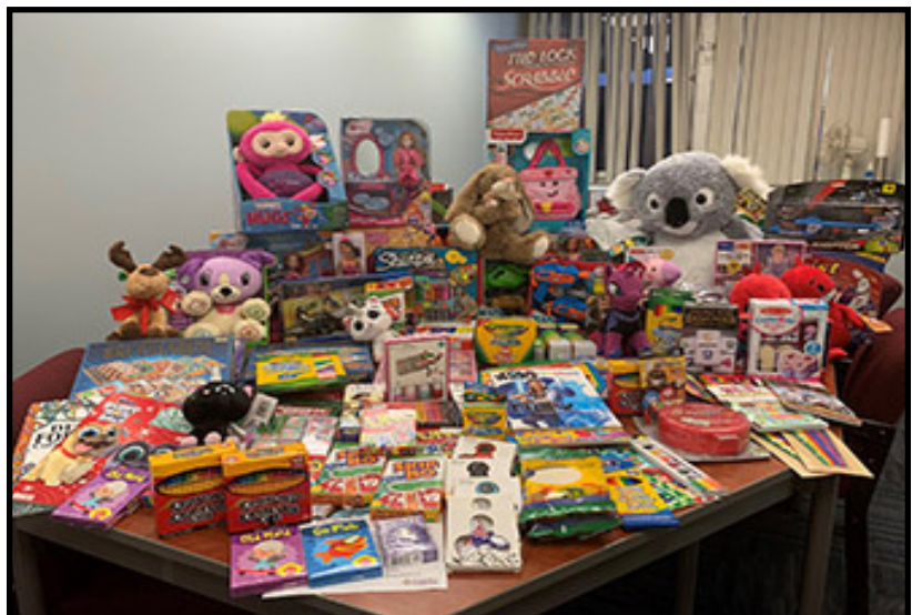
Human Resources' contribution to CT Children's Hospital