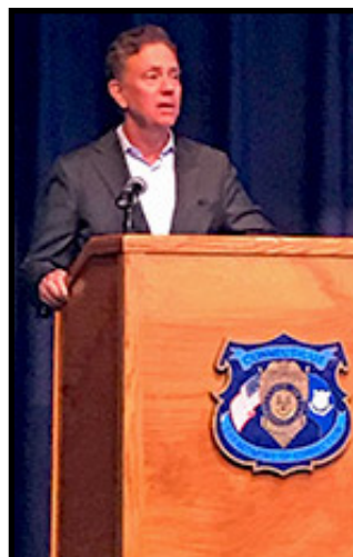
Governor Ned Lamont

In his address to the audience the Governor congratulated the graduates, and emphasized the importance of their work.