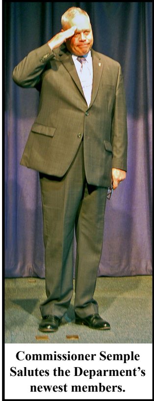
Commissioner Semple Salutes the Department's newest members.

The final message that the Undersecretary shared with Class 269 was that, “we are counting on you.” He stressed the importance of their work in not only protecting the public, but also in helping to prepare the offenders for their return to society.