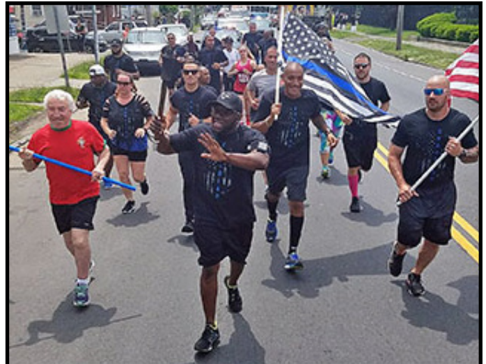
The Bridgeport CC torch bearers

Once again this year, staff members from several of the agency’s correctional facilities participated in the Law Enforcement Torch Run to benefit Connecticut Special Olympics. This year’s Torch Run took place June 6, 7, and 8th.