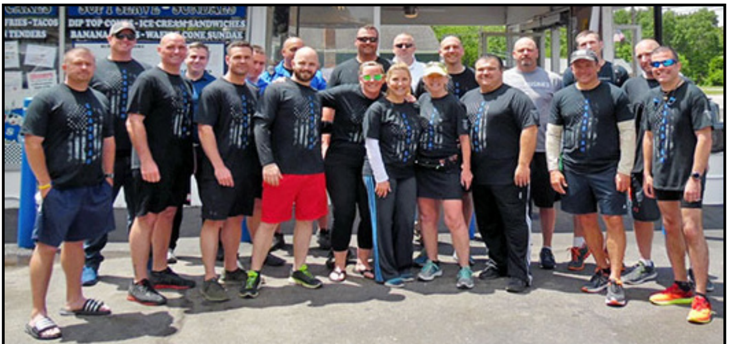
Staff members from the Brooklyn Correctional Institution just prior to their leg of the Torch Run

The Law Enforcement Torch Run for Special Olympics Connecticut is one of the movement’s largest fundraisers. This year-round program involves law enforcement officers from across the state who volunteer their time to raise awareness and funds through events they host including Tip-a-Cops, Cop-on-Tops, and Jail N’ Bail fundraisers. In addition, each year in June, over 1,500 officers and athletes carry the Special Olympics torch, with its “Flame of Hope,” through hundreds of cities and towns across the state, covering over 530 miles in three days. Officers run the “Final Leg” and light the ceremonial cauldron during Opening Ceremonies for the Special Olympics Connecticut Summer Games.