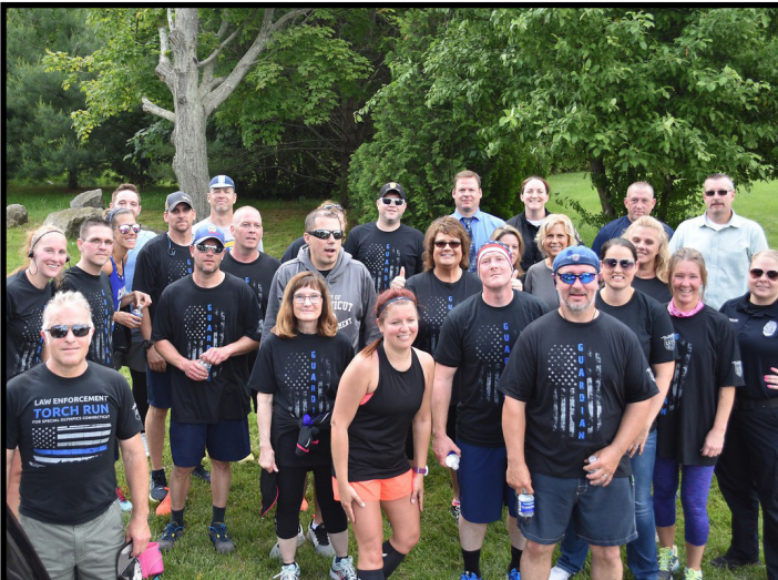
The York CI Torch Run contingent