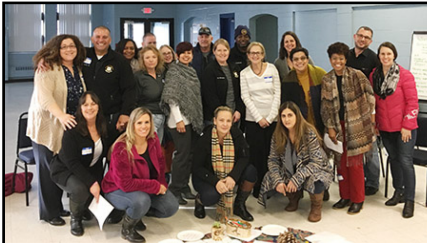
Manson Youth Institution staff members pose for a group photo after completing two days of training led by the Suffolk University’s Center for Restorative Justice, and the Deep End Diversion Program.

To that end, staff members from the Manson Youth Institution participated in two-days of training led by trainers from the Suffolk University’s Center for Restorative Justice, as well as the Deep End Diversion program.