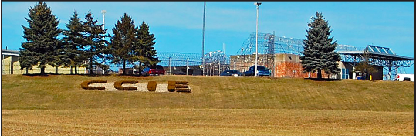
Due to a decline in the inmate population, the Enfield Correctional Institution was closed on January 23, 2018

On January 3, 2018, Enfield CI hosted an Annual Awards and Farewell Luncheon. While it is always a good thing to recognize staff for their exemplary work, it was a bittersweet event in that Enfield CI was to soon be closed, after being in operation since 1962.