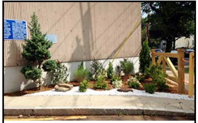
The new and improved grounds of the New Haven Correctional Center.