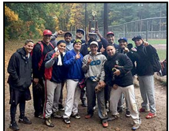
Tournament champs - the team from the Hartford Correctional Center