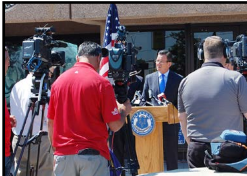
Governor Malloy addresses the media in front of the Hartford Correctional Center.