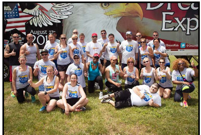
Manson Youth Institution staff members prepare to run the Cheshire leg of the 2015 Law Enforcement Torch Run to support Special Olympics Connecticut.

Staff at Manson Youth Institution joined together on Friday June 5, 2015, with members of the Department of Correction's K-9 Unit to participate in the Cheshire leg of the 2015 Law Enforcement Torch Run to support