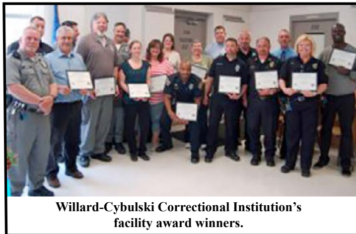
Willard-Cybulski Correctional Institution's facility award winners.