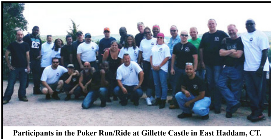
Participants in the Poker Run/Ride at Gillette Castle in East Haddam, CT.