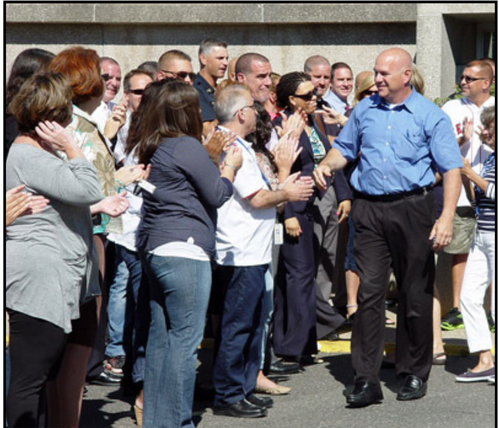
Commissioner James E. Dzurenda participates in the traditional final day “Walk Out” at Central Office on Friday, August 29, 2014.

Governor Malloy has appointed Deputy Commissioner Scott Semple to serve as Interim Commissioner of the agency. By appointing Semple, who has 26 years of correctional experience, Malloy said he’s confident the agency will continue to operate safely and efficiently during the transitional period. Commissioner Semple was immediately faced with the task of addressing the ripple effect of vacancies created by the departure of Commissioner Dzurenda.