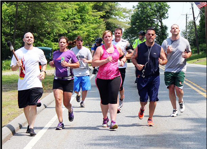
Brooklyn C.I. staff take part in the Torch Run.

The 2014 Law Enforcement Torch Run took place on June 4-6, and once again staff members from the Connecticut Department of Correction played an integral part in its success.