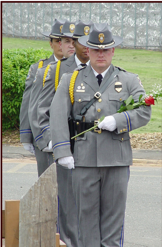
Members of the department's Honor Guard wait to place roses on the Osborn CI Memorial.