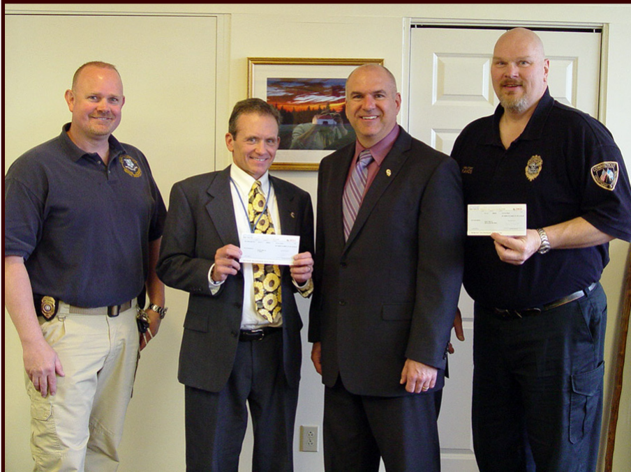
Charitable donations from last year's Commissioner's Cup Golf Tournament were distributed recently to The Connecticut Hospice Inc. ($1,250), and to the DoC's Military Peer Support Group ($1,500).