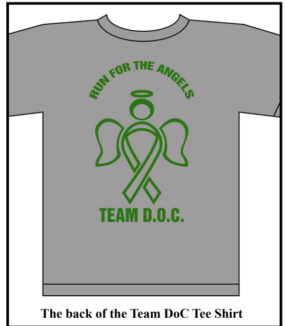
The back of the Team DoC Tee Shirt

Correctional Enterprises of Connecticut has customized a tee shirt which can be purchased for staff participating in the 5k event or by staff who don't want to run but want to contribute at a cost of $10.00. Tee shirts will go on sale as soon as possible and must be ordered on or before February 28, 2013 . Half the sales from the tee shirts will be donated to The Sandy Hook