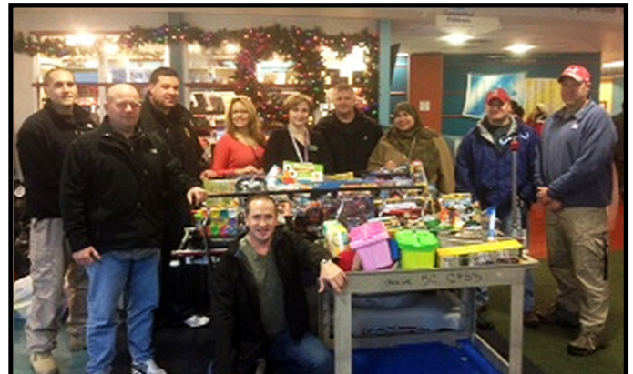
Members of the DoC Tactical Operation delivered toys to the Connecticut Children's Medical Center.

During the 2012 holiday season, the Connecticut Department of Correction's Tactical Operations Unit conducted its 1 st Annual Toy Drive to assist the Connecticut Children's Medical Center and the Child & Family Support Services Department in Hartford.