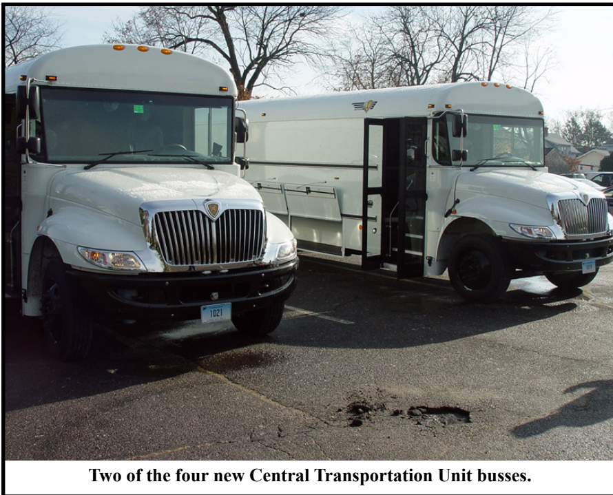
Two of the four new Central Transportation Unit busses.

One of each of the two model types were parked outside of Central Office to give staff a chance to see the finished products. One model was designed with several custom isolation cells at a cost of $155,558 per unit, while the other model has a single isolation cell at a cost of $144,440 per unit. A total of two of each bus model was purchased for a total cost of $599,996. In addition to the new busses, the department also purchased mechanical diagnostic software packages which will assist in proper maintenance of the vehicles.