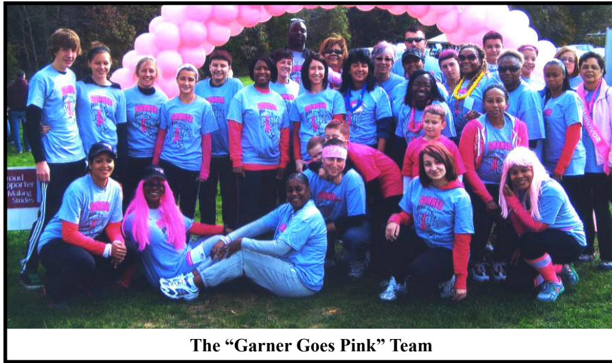
The “Garner Goes Pink” Team

The staff at Garner CI invested in raising awareness for a disease that has affected so many families, friends and fellow staff by fundraising events: luncheons, bake sales, the sale of breast cancer pins and tee shirts throughout the year. The facility raised a total of $2,800 with all proceeds being donated to the American Cancer Society.