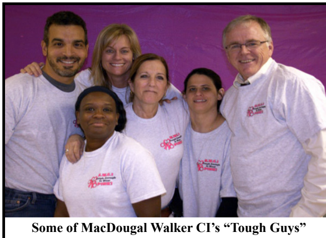
Some of MacDougal Walker CI’s “Tough Guys”