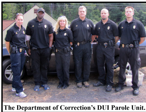
The Department of Correction’s DUI Parole Unit.

The Connecticut chapter of Mothers Against Drunk Driving (MADD) recently selected the Department of Correction’s DUI Parole Unit as the recipient of the MADD DUI Parole Unit Award. The award was presented during MADD’s annual Community Champions dinner which was held on October 30 th at Anthony’s Ocean View in New Haven, CT. The DUI Parole Unit Award was presented to the officers of the DoC Parole Unit for their hard work and dedication in ensuring that parolees are successful in transitioning into positive members of the community.