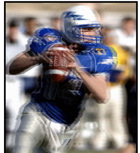
LCD TVs can be susceptible to poor motion tracking.

Now starts the confusion about current television sets on the market place called LED televisions. They are really an LCD television that uses LED’s to enhance their television’s display capability to reproduce deep blacks and depth of color. There are two types now available - Edge Lighting, where a series of LED’s are placed behind the outer edges of the screen, and Full-Array where LED’s are placed behind the entire surface of the screen. Full-Array will enhance the entire screen, while Edge Lighting will enhance only the outer edges of the televisions display. LED technology is incorporated on the high end LCD sets. For more information go to the manufacturers’ and consumer ratings web sites.