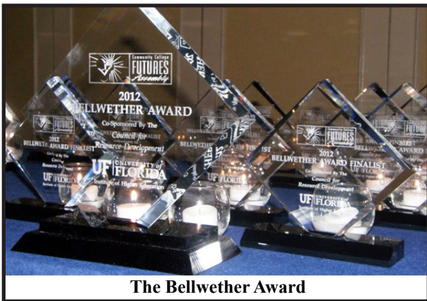
The Bellwether Award