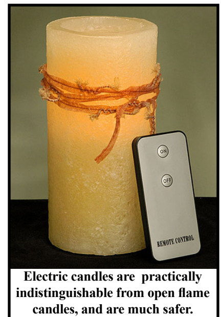
Electric candles are practically indistinguishable from open flame candles, and are much safer.

Always remember to turn off (and unplug) the heater when leaving the room for an extended period of time.