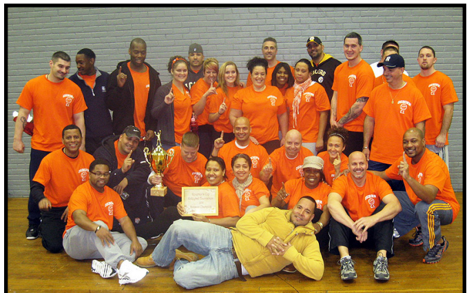
The two-time volleyball champions from Osborn CI.