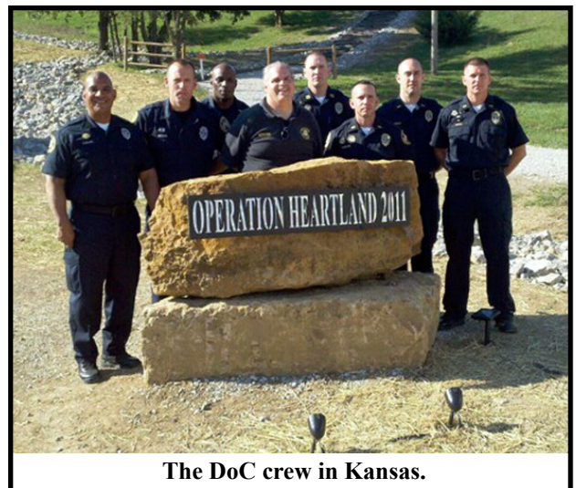
The DoC crew in Kansas.