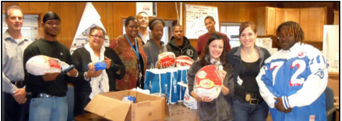
Staff members from the Bridgeport Parole and Community Services office show off their bounty.