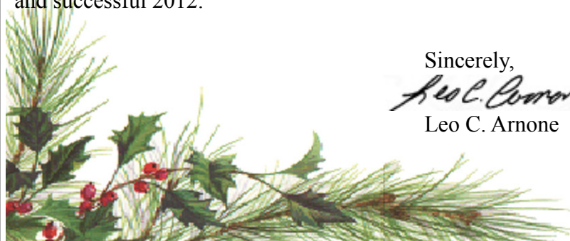
Leo C. Arnone

November 18, 2011 through December 21, 2011