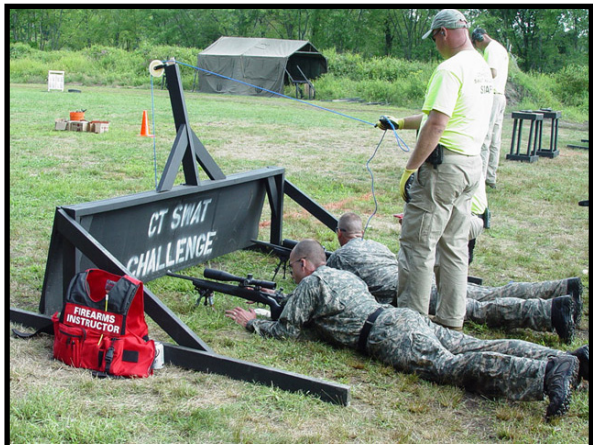
...Now you don't.