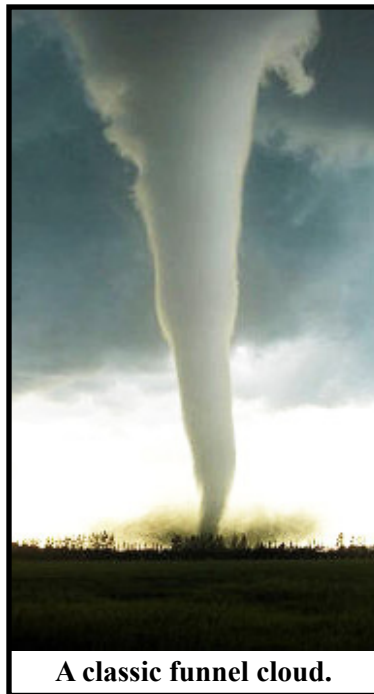
A classic funnel cloud.

The 2011 outbreaks have reminded us how powerful these storms can be; occurring anywhere, disproving the myth that city dwellers are safe from tornadoes. The safest thing to do during a tornado warning is seek shelter in a basement or find an area away from windows in order to be protected from flying debris.