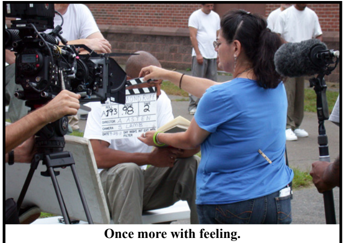
Once more with feeling.

The filming of Diamond Ruff is the third film in as many years to have at least in part have been filmed on the grounds of the Cheshire facility. In 2009 the much anticipated, yet ultimately disappointing, movie Everybody’s Fine starring Robert Dinero, shot a few scenes in and around the Cheshire Correctional Institution.