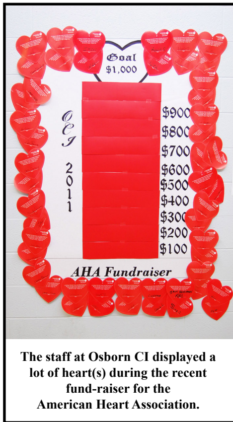
The staff at Osborn CI displayed a lot of heart(s) during the recent fund-raiser for the American Heart Association.

The 2011 Hartford Heart Walk is scheduled to take place in Bushnell Park on October 29, with registration from 9:00 AM - 11:00 AM.