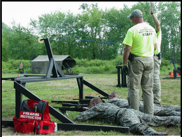
Now you see the target...