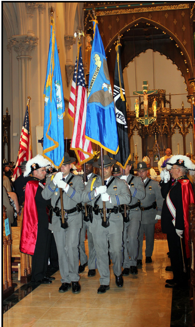
The Department of Correction's Honor Guard exits the 21 Annual Blue Mass held at St. Patrick's Cathedral in Norwich.