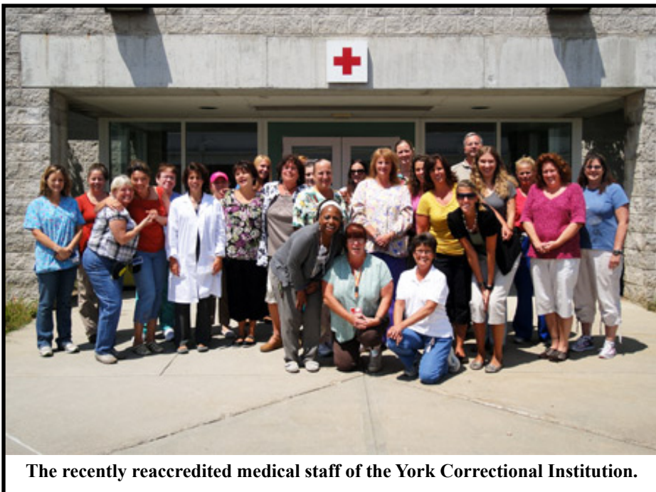
The recently reaccredited medical staff of the York Correctional Institution.

York CI receives a perfect reaccreditation score