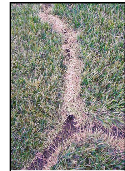
Mole tunnels destroy lawns.

There are three basic options used to eliminate moles: Repelling them, trapping them without killing them, and killing them. There are many ways to ward off moles including ultrasonic/vibration devices and chemical applications. Depending on who you talk with these options are typically not successful. Live trapping can work, but it is often difficult. You can purchase traps and try it yourself or hire a professional to take care of this. If you do manage to catch a mole, the relocation to other properties is illegal in Connecticut.