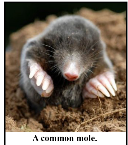
A common mole.

Most experts will tell you that the most effective way to rid your yard is to kill the mole. A little bit of internet research will show you that there are many different styles of traps that perform this function. Most are operated using some type of spring loaded spikes that are triggered when the mole crawls down its path. Using any type of poison to kill a mole is not a good idea. This method is definitely not advisable if you have pets, children, or anything living on or around the area affected by moles.