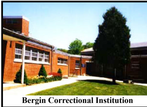
Bergin Correctional Institution