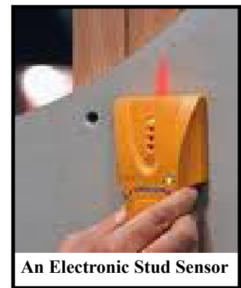
An Electronic Stud Sensor

very strong. Only light weight items such as small shelves, towel bars and small curtain rods should be attached with anchors. Do not attach large items such as video displays, microwaves or large shelves to walls if you cannot fasten the object to a wall stud with some of the screws. Heavy objects will pull anchors out of the wall, possibly taking pieces of wall with them.