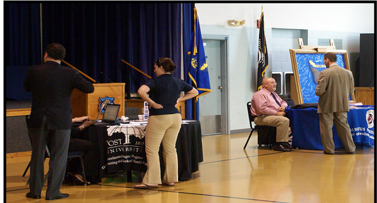
Attendees discuss program offerings with representatives from area colleges and universities during the College Fair held at the Maloney Center for Training and Staff Development.