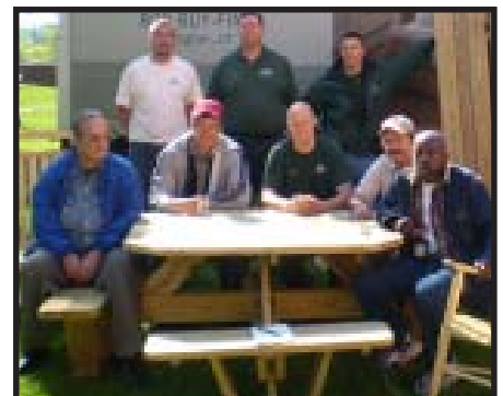
Union donated picnic furniture

In addition to the televisions, A F S C M E Council 4 also raised more than $10,000 for the purchase of custom-made yard furniture. Earlier this year,