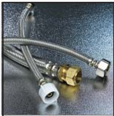
Flexible Supply Lines

Today, it is much easier to replace a faucet. First, close the hot and cold water supply valves under the sink and verify that the water does not flow from the faucet. The old faucet may have 3/8 inch diameter tubing that is attached to the water shut off valves with a threaded compression fitting. Remove the hardware attaching the faucet to the sink then loosen the nuts on the fittings and remove the faucet from the sink. If the faucet supply lines are soldered directly to the shut off valves, cut the lines 1 inch above the valves and use 3/8 inch compression adapters that match your supply pipe size. Compression fittings use a removable nut and compression ring that go over the supply pipe. The nut is tightened and compresses the ring onto the pipe to create a watertight joint. Now the old faucet is gone and you have a 3/8 threaded compression fitting near the shut off valve ready to accept the new faucet supply lines.