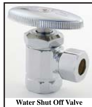
Water Shut Off Valve

If you don't have shut off valves under your sink or the valves don't stop the water flow, you can install a new valve easily. There are 1/4 turn ball valves with 3/8 inch compression fittings on one end and 1/2 inch compression or threaded fittings on the other end. Close the main water valve to your house. Remove the defective shut off valves if you have them. The supply pipes will most likely be 1/2 inch copper tubing or 1/2 inch threaded pipe. Install the new valves using compression fittings or threads. If using threaded valves, wrap 2 turns of Teflon tape on the pipe threads to seal the joint. Close the sink shut off valves, open the main house water valve and check for leaks.