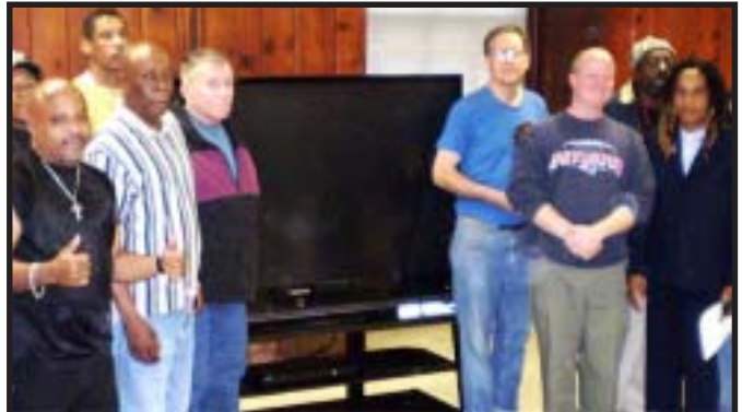
AFSCME members donate plasma TVs to appreciative veterans.

Members of the American Federation of State, County, and Municipal Employees union paid tribute to our country’s veterans by donating eight plasma televisions