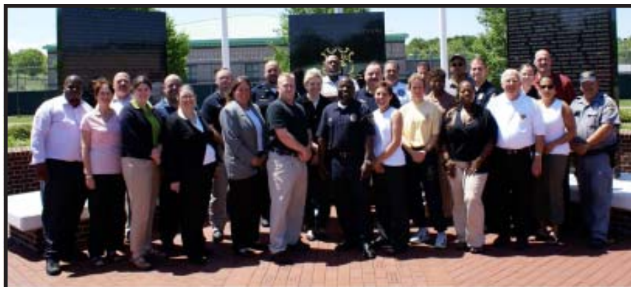
Once again, The Staff of the Maloney Center for Training and Staff Development scored 100% on their ACA accreditation review

The auditors at MacDougall-Walker CI cited the cleanliness, professionalism, hospitality and team work between custody and medical staff as some of the highlights during their stay. Pleasantly surprised by the number of staff who introduced themselves and asked how the audit was going, one of the auditors commented, “...you don’t see that in a lot of the places I go to.”