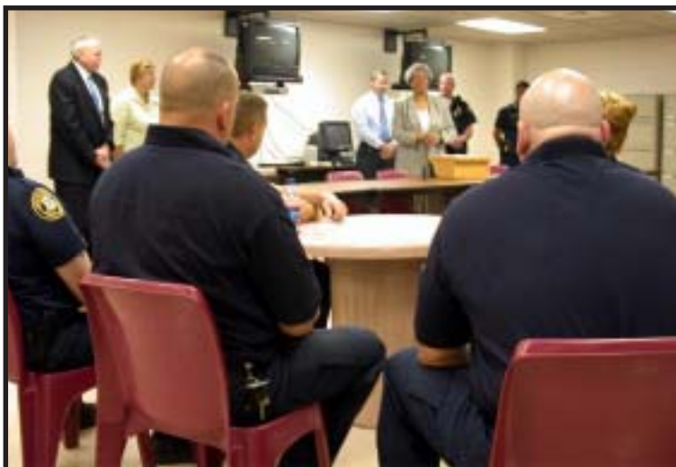
Staff of MacDougall-Walker Correctional Institution listen as the ACA Auditors give them the good news.

You would have to have been an “A” student in school to know just how the staff of the Maloney Center for Training and Staff Development and the MacDougall-Walker Correctional Institution (MWCI) felt after their recent accreditation audits. After three days of intense scrutiny, by experienced correctional auditors from Texas and Pennsylvania, MWCI scored an astounding 99.5 percent on a total of 531 standards. This for the largest correctional institution in New England that holds more than 2,000 of the state’s high security and high profile inmates.