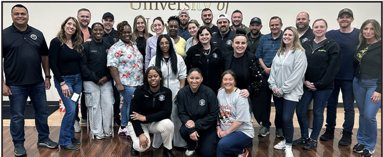
Participants and instructors of the five-day CISRT training session held at the University of New Haven.

Twenty five members of the Department's Critical Incident Stress Response Team (CISRT) recently attended a week-long training held at the University of New Haven in order to enhance their skills and preparedness. The Critical Incident Stress Management training took place May 5-9. Participants were instructed on the basic principles of suicide prevention; defusing practices; debriefing skills after traumatic events; and support for grieving individuals. Upon completion of the week-long training, participants qualified for nationally recognized certification from the International Critical Incident Stress Foundation.