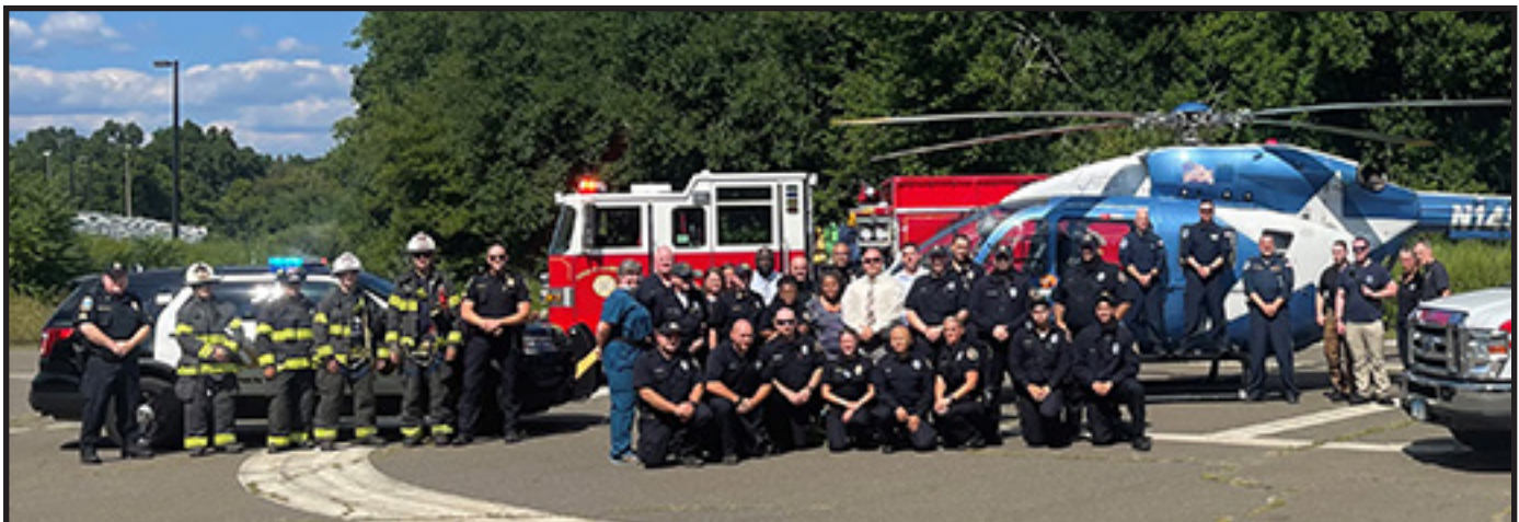
Staff of the Garner Correctional Institution in August took part in a simulated Life Star drill. Also taking part in the drill were representatives from the Newtown Police Department, Newtown Hook and Ladder Company, Newtown Volunteer Ambulance, and Hartford Health Care's Life Star crew.

On August 25, 2022, the New Haven Correctional Center was issued provisional accreditation, noting that they were in compliance and striving toward achieving full accreditation. The Bridgeport Correctional Center completed its accreditation process on June 27, 2022. They, too, were issued provisional accreditation noting that they were striving toward achieving full accreditation, and would be achieving that on or around October 19, 2022. Both New Haven CC and Bridgeport CC staff members from various units, and the vendor's staff, came together as a team to work with the accreditors to ensure compliance with all 47 standards. During September the NCCHC visited the Cybulski CI building, the Hartford CC, Robinson CI, Osborn CI, and the Walker CI building to evaluate their OTP programs, and determine if they met the standards for accreditation. These facilities will be notified of their status within the next three months. These accreditations illustrate the hard work, dedication and teamwork of the Administration, Medical, Custody, Addiction treatment and Vendor staff. During all of the site visits, the accreditors noted the dedication and professionalism of the DoC's staff, as well as their commitment to getting the job done.