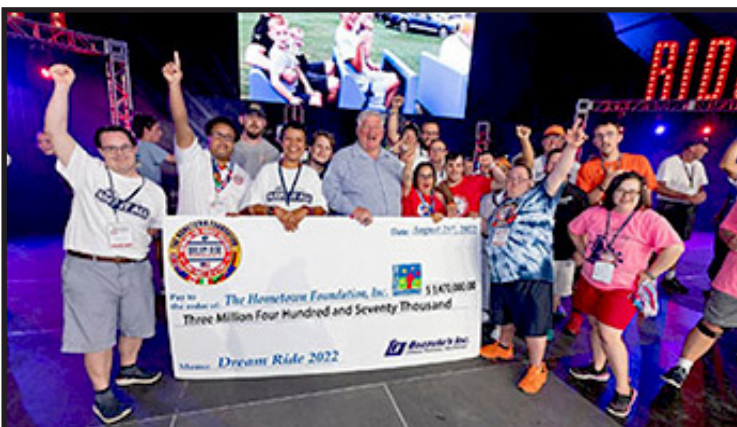
This year's Dream Ride raised nearly $3.5 million for The Hometown Foundation charitable organization.

Volunteers aside from giving of their time, also lend their smiles, hugging athletes, high-fiving athletes, and providing encouragement, helping