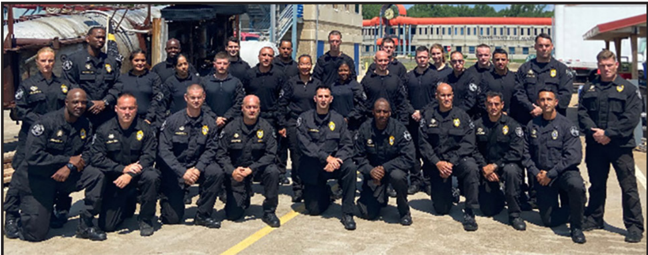
The members of CERT Basic Class 22-01, along with their instructors.

Seventeen staff members successfully completed a two-day assessment followed by a two-week CERT Basic Training. This class represented several hazardous duty job classifications within our agency. These staff members endured vigorous physical training, while learning tactical formations and tactics as well. Many of