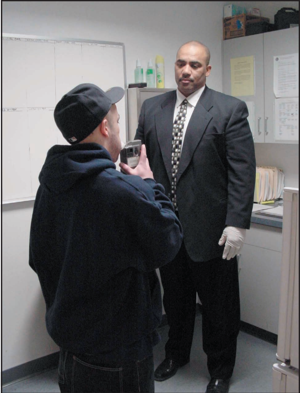
To insure that the public is protected, Parole and Community Services staff closely supervises those appropriate offenders who will serve a transitional period of their sentence in the community. Here an offender is checked for the prohibited use of alcohol.