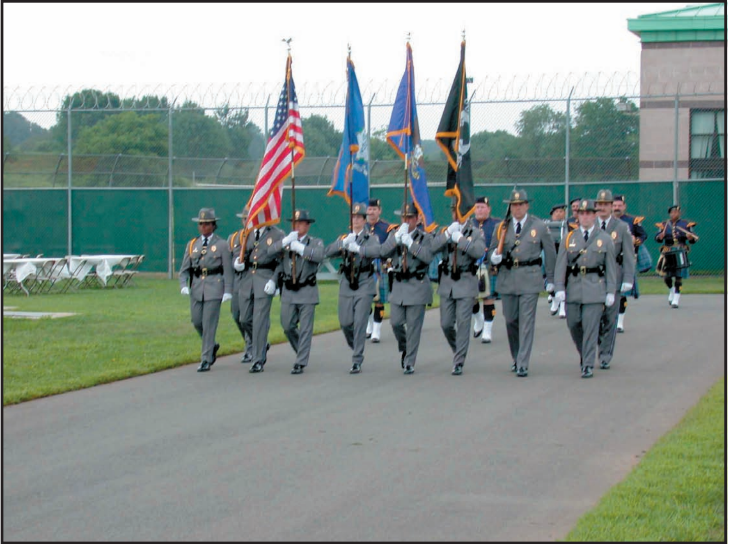
The Connecticut Department of Correction elite Honor Guard and Bagpipe Band set the standard during the agency's Annual Awards Ceremony recognizing correctional excellence.