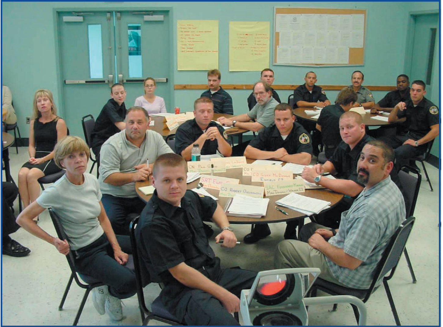
As cadets, line personnel, and managers, staff receive on-going training that utilizes a foundation of mentoring guidance to insure that today's expectations and tomorrow's challenges are met with a national model of excellence.