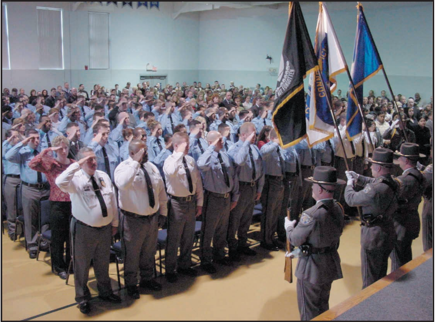
Having completed 10 weeks of rigorous training at the nationally accredited Maloney Center for Training and Staff Development, a new class of correctional professionals salutes the agency's Commissioner during their graduation.