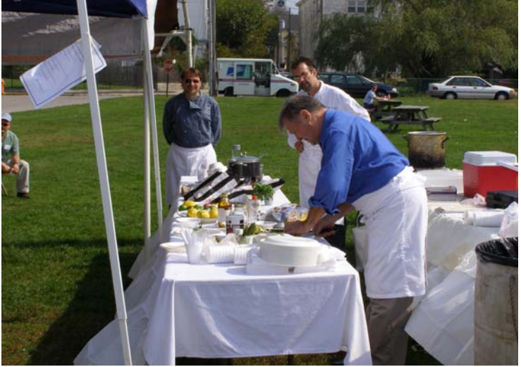
Jacques Pepin, famous chef, prepares a Connecticut seafood specialty for tour attendees.