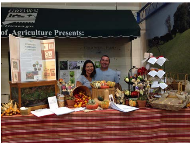
Above: Booth 6a Example, 10' x 10' with sink in back right corner