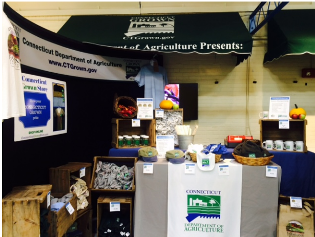
Above: Booth 7 Example, 10' x 10'