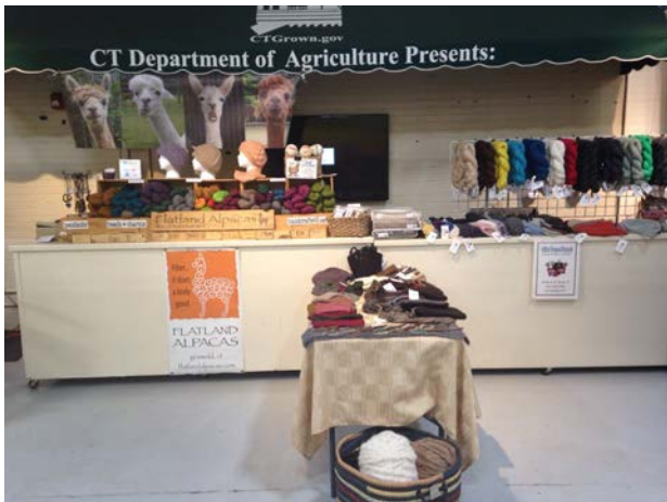
Above: Booth 6a & b Example, 10' x 20'