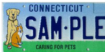
(SAMPLE OF “CARING FOR PETS” PLATE)

Plate applications are located at all DMV outlets, veterinary practices, municipal pounds, town halls, pet and grooming shops, boarding kennels, auto dealerships or by calling the APCP at 860713-2507. Plates can be ordered over the phone by calling the DMV at 800-842-8222. Plates can be ordered online as well by going to the DMV website at www.ct.gov/dmv . The website allows the public to view the dog/cat design and provides citizens the ability to type in available acronyms for those seeking vanity plate combinations.