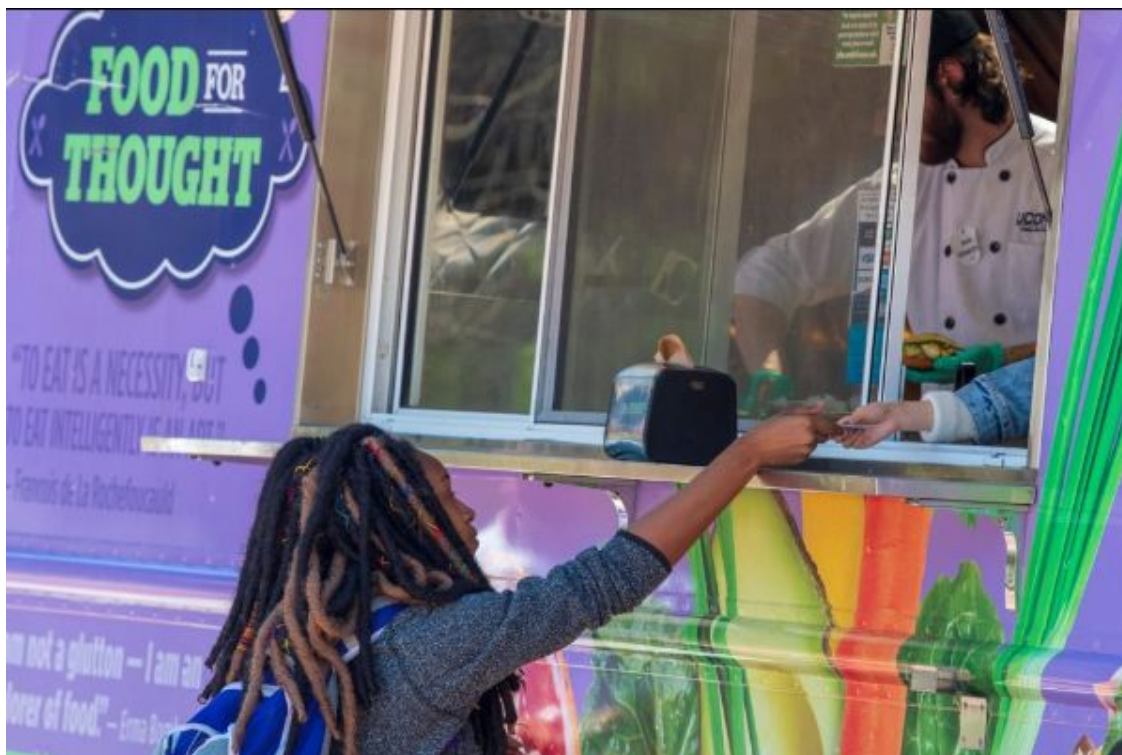
PROPOSED CENTER FOR FOOD INNOVATION SEEKS COMMUNITY INPUT

CT LIVE!: Community Supported Agriculture in Connecticut, NBC CT, 3/9 Melissa in the Morning: Bird Flu in Connecticut, WTIC, 3/8