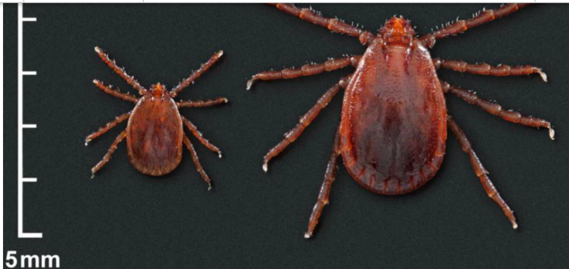
Asian longhorned tick, Haemaphysalis longicornis (nymph and adult female)