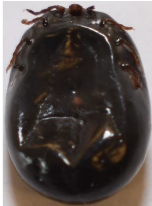
Asian longhorned tick, Haemaphysalis longicornis