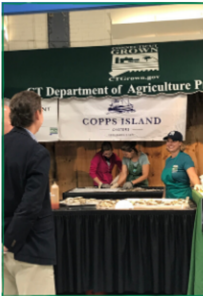
Exhibit at the 2020 Big E

Applications are due to the Connecticut Department of Agriculture by 4:00 p.m. on April 23, 2020.