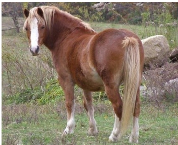
Melvin, the Haflinger cross pony is "Ready for Winter".

The thickness of the animal's coat, and if the coat is wet or dry, effects the insulation value of the coat. A wet coat increases heat loss up to as much as 40 percent. This causes the animal to burn its own energy to maintain body temperature.