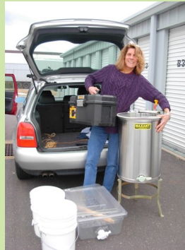
A beekeeper picking up extractor equipment at the storage facility.