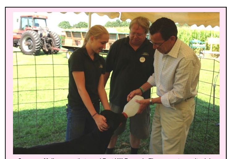
Governor Malloy recently toured Fort Hill Farms in Thompson to see its dairy herd, pick-your-own crops, display gardens, corn maze, and other agritourism features, as he visited popular tourism destinations in Connecticut.

There is no charge to attend. Go to <a href="www.stepct.com">www.stepct.com</a> for more information and/or to register.