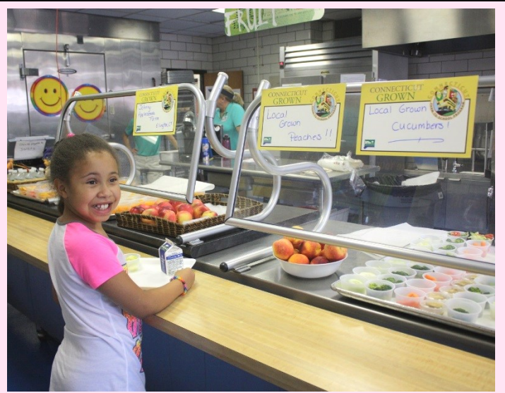
A student peruses her Connecticut Grown choices at Pleasant Valley Elementary School in South Windsor during CT Grown for CT Kids Week

All 16 schools in Connecticut served by Sodexo foodservice providers committed to reading the book during this celebratory week. Any Connecticut school foodservice director can receive a copy of