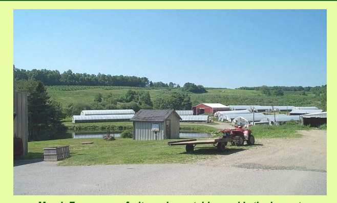
March Farm grows fruits and vegetables and is the largest greenhouse tomato operation in Connecticut

In February, the state submitted a proposal to NRCS for $6 million to partner on the purchase of development rights to 19 additional farms totaling an estimated 2,420 acres.