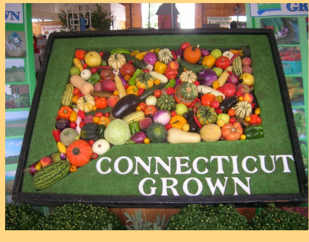
DoAg's Connecticut Grown produce collage is a popular display each Labor Day Weekend in the Agricultural Exhibition Building at the Woodstock Fair

The Association of Connecticut State Fairs has a comprehensive list of contests and rules, and a fair events schedule, available on their website, <a href="https://www.ctagfairs.org">www.ctagfairs.org</a>.