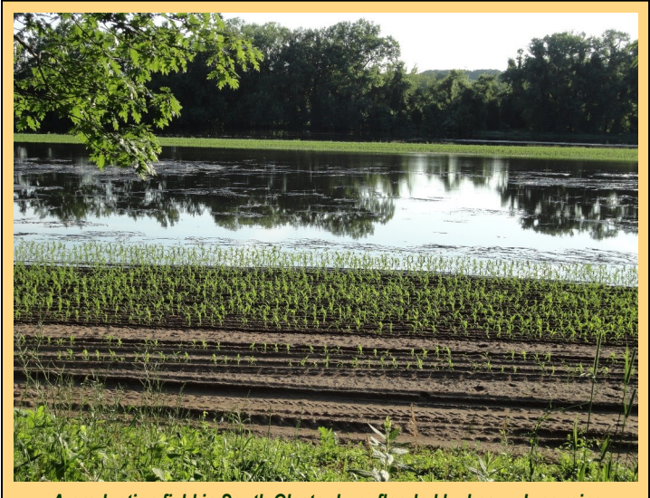
A production field in South Glastonbury flooded by heavy June rains