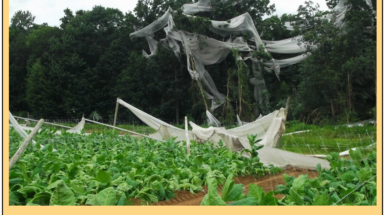
Damage to tobacco irrigation and shading systems from a July tornado in Windsor

Managing risk is an essential part of any business. Agricultural operations are no exception. There are relatively simple steps that can be taken to protect you and your family, farm workers, livestock, and crops during times